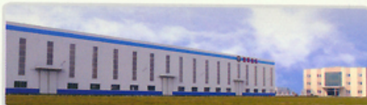
TAIPEI HEADQUARTER (SINCE 1976) , TAIPEI FACTORY, SHANGHAI FACTORY