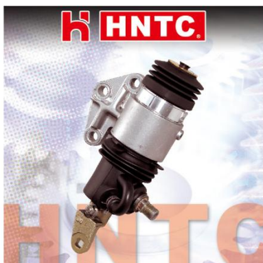
SERVO, GEARSHIFT 補助缸 RH 十字型 LFS*98 GH FG FM2P 33510-1270 33510-1450 654-04505