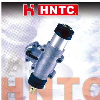
SERVO, GEARSHIFT 變速補助缸 LH FP517 FP510 ME670046 654-01045 SERVO, GEARSHIFT 變速補助缸 LH FP415 K13C SH 654-01006 ME657610-H