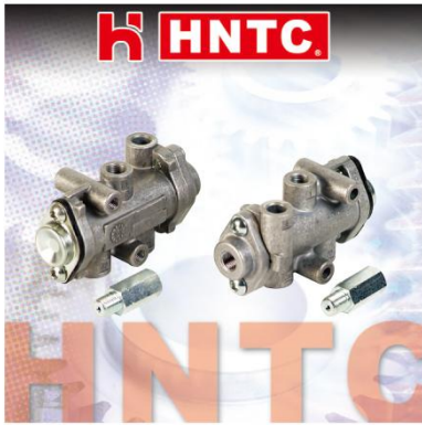
CONTROL VALVE 擋位補助活門開關 GH FG 44540-2170 X8880843