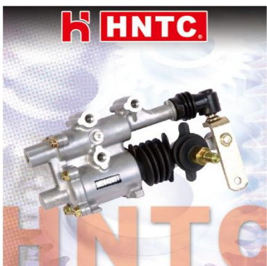
HNTC SERVO, POWERSHIFT 變速補助缸(雙管)柄圓孔.右 FK61F ME642651