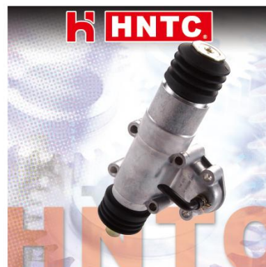
SERVO, GEARSHIFT 變速補助缸 RH 加強型 LRM LCM 33510-1230