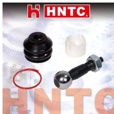
HNTC END, SHIFT CYL VALVE EURO 2. 變速補助缸前和尚頭(16速) ZF16S151二期車K13C LSH EXR37 33076-1600-H