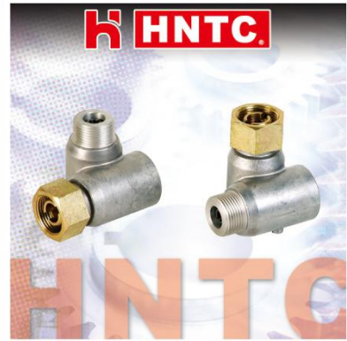
L-JOINT, T/M L型接頭 FUSO NISSAN ME628803-H @ 1.077 ME628800-H @ 1.000 ME626645-H @ 0.905 ME629346-H @ 0.619 ME629325-H @ 0.889 ME629329-H @ 0.818 25097-90078-H @ 1.125 ME629331-H @ 0.733 ME629326-H @ 0.870 ME629302-H @ 1.053