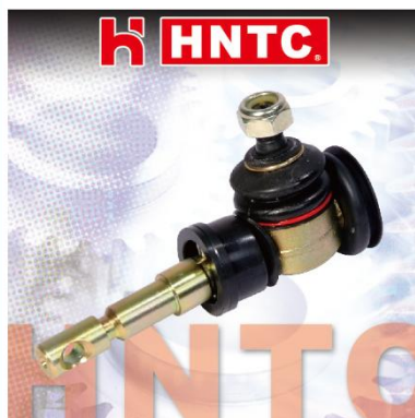
HNTC END, SHIFT CYLINDER EURO 2. 排檔開風汽缸內球頭防塵套 ZF16S151 二期車 33519-1060-1H