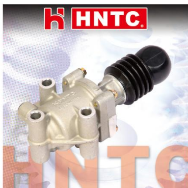
VALVE, H/LA'SSY 高低檔控制缸(十速)行程32mm M8SO 6M60 ME675132-H