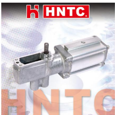
HNTC VALVE, SHIFT CYLINDER EURO 3. 補助缸(ZF16S151) ZF16S151三期K13C-TV 6WA1-20 0501-211-290-H