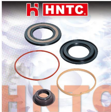
KIT, H/L T/M ZF.16速高低檔控制缸修理包 ZF16S151 LSH1K(16S) 1315-334-033