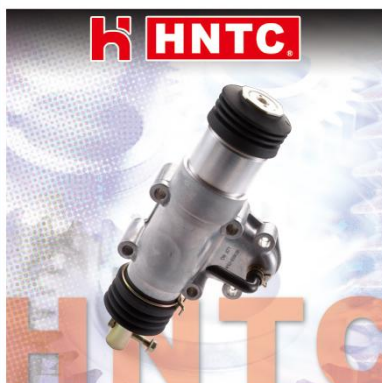
SERVO, GEARSHIFT 變速補助缸 RH FM65(10速) 6M60 17T ME679240