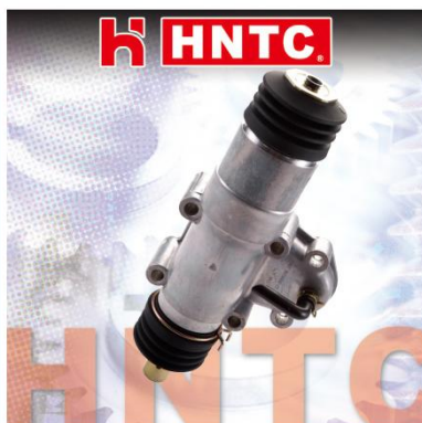
SERVO, GEARSHIFT 變速補助缸(RH.大管.加強) MGH 240P/H 33510-1060