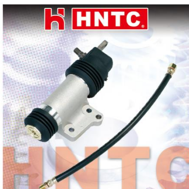
SERVO, GEARSHIFT 變速補助缸RH 三孔 CWA451 CD461 32172-90202