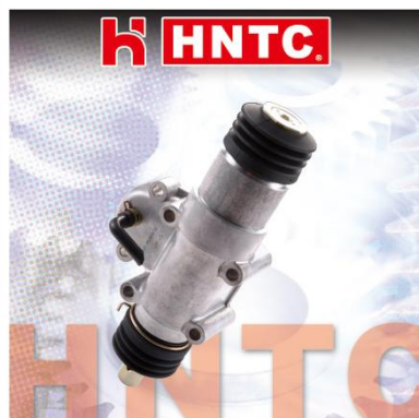
HNTC SERVO, GEARSHIFT 變速補助缸 LH, 64/81/62mm M130 M14 FP51JRL*03 654-01015 ME677211 654-01098