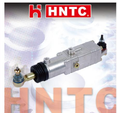
HNTC VALVE, SHIFT CYLINDER 補助缸活門 ZF 16 SPEED 6038-211-086-H TRUCK 6038-211-085-H BUS