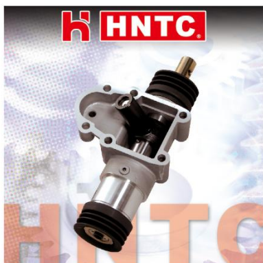
SERVO, GEARSHIFT 變速補助缸 LH FVR*96 6HE1 D=28mm 1-33730127-0