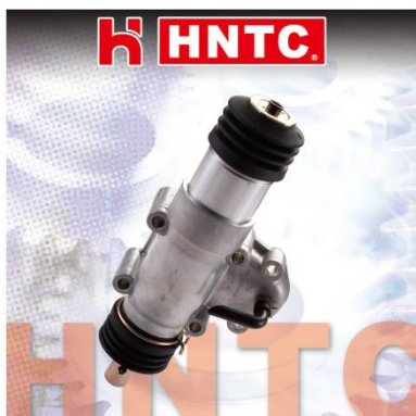
HNTC SERVO, GEARSHIFT 變速補助缸 RH FM557-96(15T) FM657 FK617 MP617 FH217 ME636977