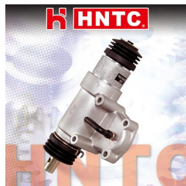
SERVO, GEARSHIFT 補助缸 RH 12速 CK450*93 33172-90102 654-02014 32172-90102