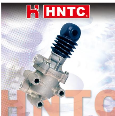
CYLINDER, GEARSHIFT 高低檔控制缸總成 M12-3S10 FV415 ME652800 661-00518 CYLINDER, GEARSHKFT 高低檔控制缸總成 FP517 FV515 M120 ME671397