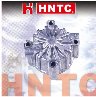
CASE, H/L T/M 高低檔控制缸殼 ZF-16S151 LSH1K 1315-334-052 ZF-161S151 1315-334-056