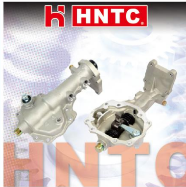
HNTC GEARSHIFT, M/T, UPR 3HOLE 變速箱上蓋彈簧SPRING x 2 M120 FP517 6S 7SPEED ME657708-H