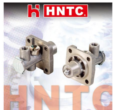
CONTROL VALVE 擋位補助活門開關 FL12 FL10 1068951