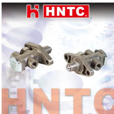
CONTROL VALVE 擋位補助活門開關 P113 P114 1319557