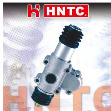
SERVO, GEARSHIFT 變速補助缸 RH EXR340-91 D=28 1-33730062-1 654-03076