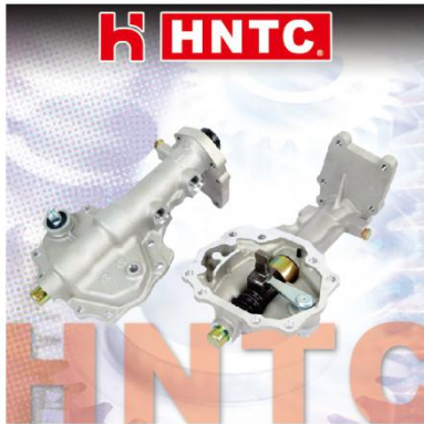
HNTC GEARSHIFT, M/T, UPR 變速箱上蓋銅套BUSH+SPRING M120 10SPEED ME657709