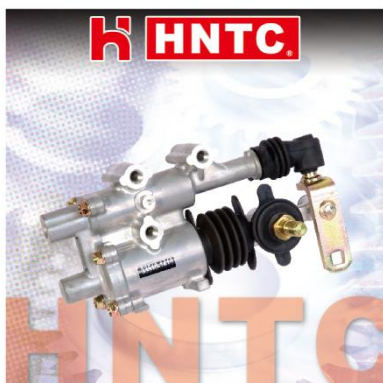
HNTC SERVO, POWERSHIFT 變速補助缸(雙管)柄方孔.右 FG GD FF FG1 33510-1410