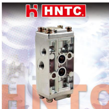
VALVE, HIGH/LOW 16速高低檔氣壓開關 ZF151 K13C LSH EXR360 0501-209-435 35450-1020