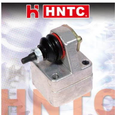
HNTC END, SHIFT CYL VALVE EURO 2. 補助缸後蓋球頭組(二期) ZF16S151二期16S 6038-211-1-H