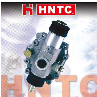
SERVO, GEARSHIFT 變速補助缸 MS618 MP618 654-01112 ME662831