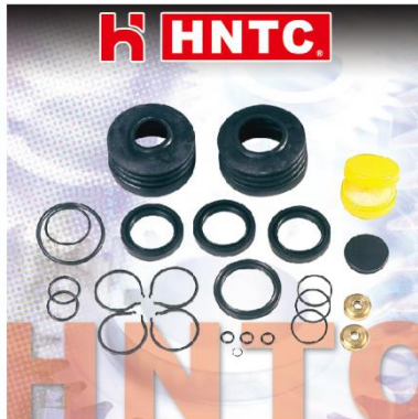
SERVO KIT, GEARSHIFT 變速補助缸修理包 FP415 FV419 FP418 9365-0029