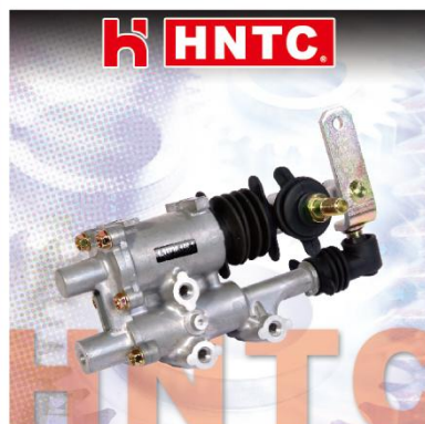
HNTC SERVO, POWERSHIFT 變速補助缸(雙管) FUR FRR 1-33730-156-H