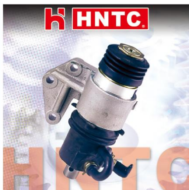
SERVO, GEARSHIFT 變速補助缸 RH T型 LSH TRAILER HEAD 33510-1280 R/KIT 33590-1310