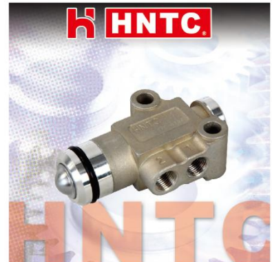
81-82170-6156 HIGH / LOW VALVE 高低檔控制活門 MAN