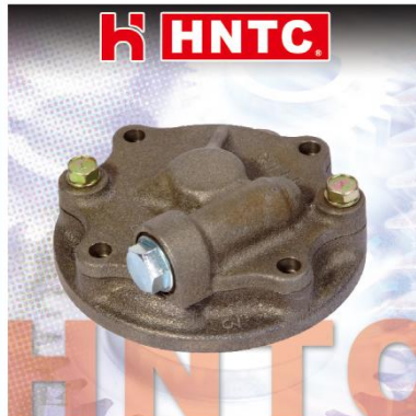
HNTC OIL PUMP, TRANSMISSION 6SP 7SP 變速箱機油邦浦總成.6/7速用 M120 M130 ME671568-H