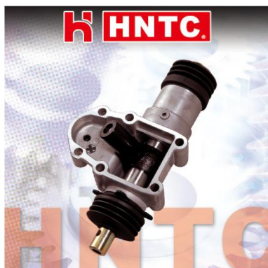
SERVO, GEARSHIFT 變速補助缸 RH EXR340*96 6WA1T D=30mm 1-33730103-1 654-03083