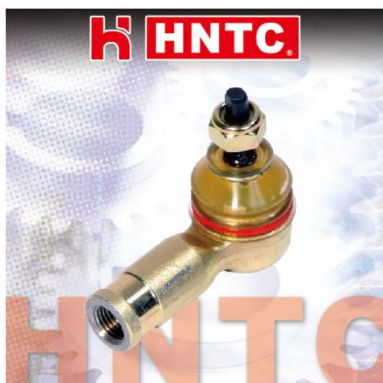
HNTC END, SHIFT CYL VALVE EURO 2. 補助缸後球頭修包(16S) ZF16S151 LSH EXR370;K13C 33076-1602-H