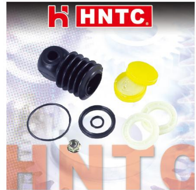
SEAL KIT, H/L CYL 高低檔控制缸修理包 M12-3 M12-4 M130 ME652403