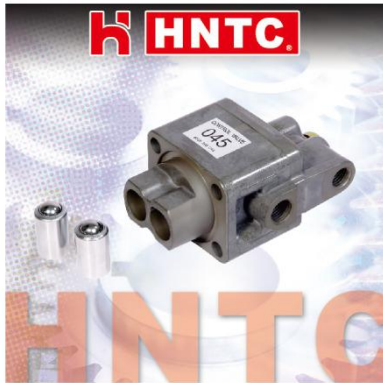
VALVE, H/LT/M 小蓋高低檔切換活門(2珠) ZF16S151 (2/3期; ALL) 6038-202-045