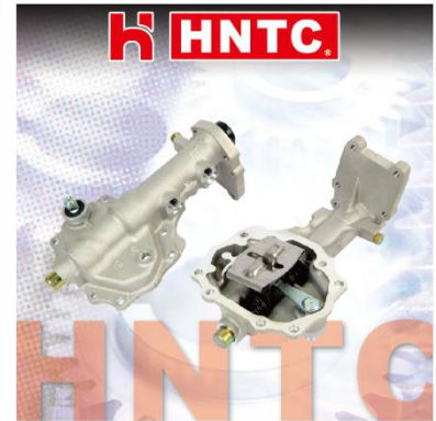
HNTC GEARSHIFT, M/T, UPR 變速箱上蓋彈簧SPRING X2 M12-3 M12-4 M10-3 6S 7S 10S ME662308