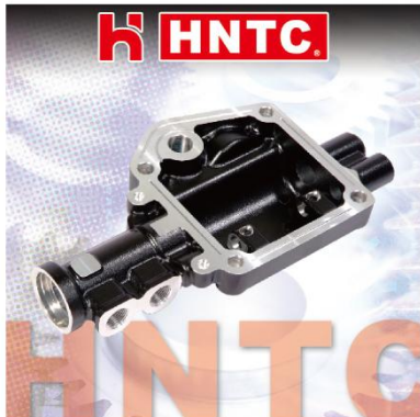
HNTC COVER, TRANSMISSION UPPER 變速箱小蓋(全)2孔S/W.固孔4孔 F20C - 1998Y 33271-2302