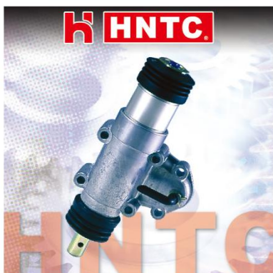
SERVO, GEARSHIFT 變速補助缸 RH CW520 EXR330 LSH LRM FN527 FM515 MGH 654-04000