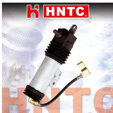
SERVO, GEARSHIFT 補助缸(改良型) RH MFG-90福將*4孔 33510-1055