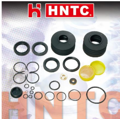
SERVO KIT, GEARSHIFT 變速補助缸修理包 MP618 MS715 9365-0039