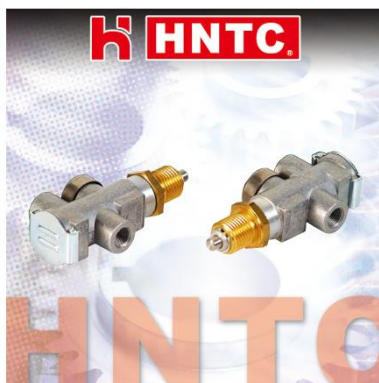
CONTROL VALVE 擋位補助活門開關 GH FG 41480-1100 X8880054