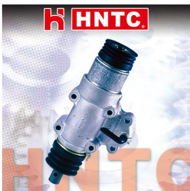
SERVO, GEARSHIFT 變速補助缸 RH LSH LFS 33510-1160 654-04017