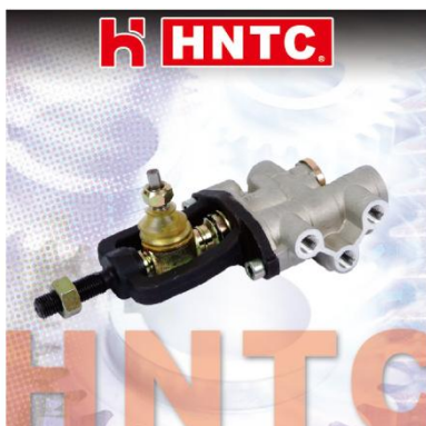
HNTC SHIFT CYLINDER, SERVO 開風活門汽缸 ZF 16 SPEED 0750-1320-100-H