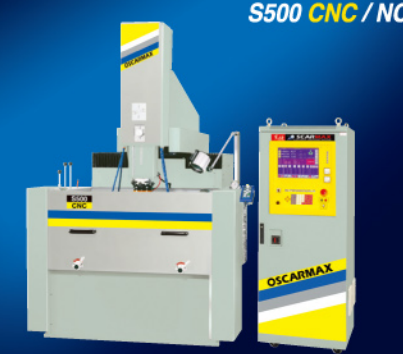
S500 CNC / NC