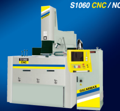
S1060 CNC / NC