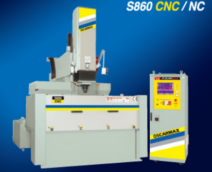
S860 CNC / NC