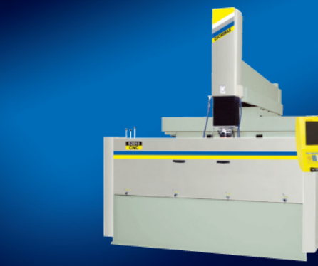
S2010 CNC / NC