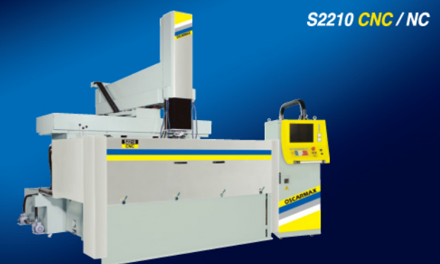
S2210 CNC / NC