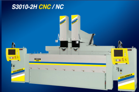
S3010-2H CNC / NC