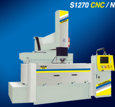
S1270 CNC / NC