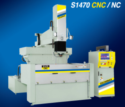
S1470 CNC / NC