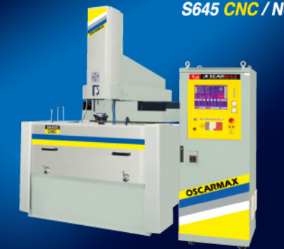
S645 CNC / NC