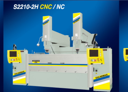
S2210-2H CNC / NC