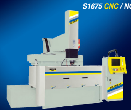
S1675 CNC / NC