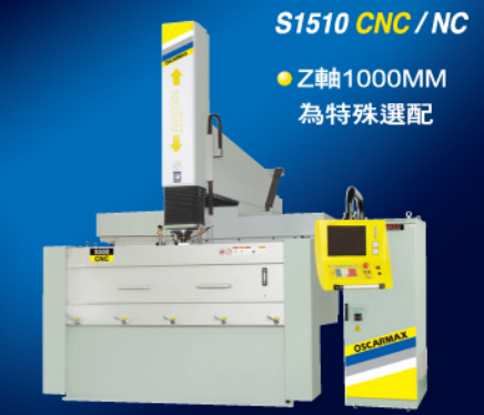
S1510 CNC / NC