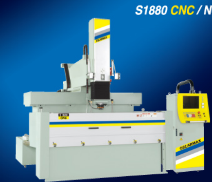
S1880 CNC / NC