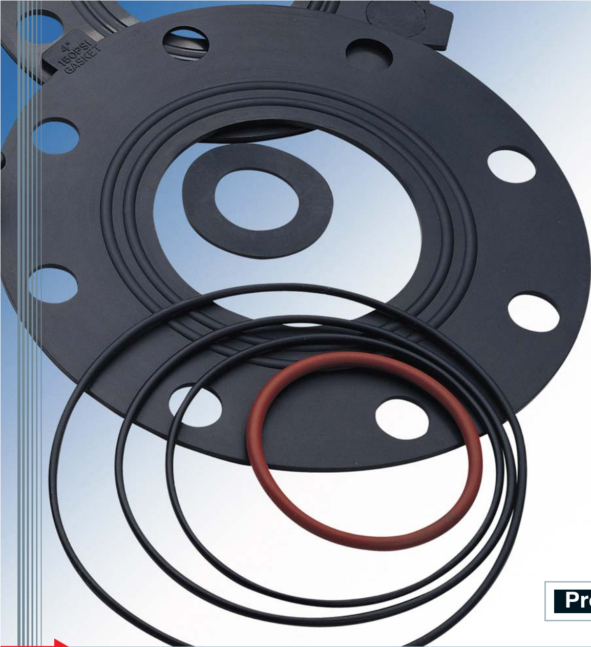
Products of the company